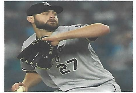
Lucas Giolito – Pitcher

What do these 3 Chicago sports professionals share in common? Their jerseys are all #27! In working our AA program, “27” is a pretty “ BIG DEAL ” as well . . . The sum total of the benefits received when working Steps 3 + 6 + 7 + 11!